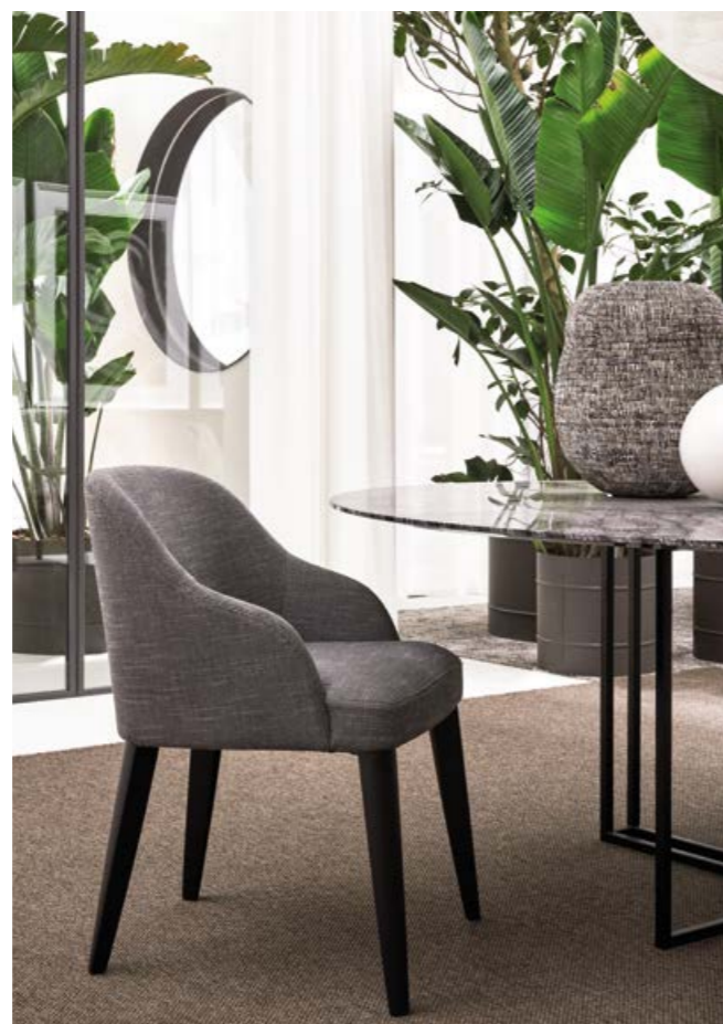
ODETTE DUE sedia . chair PLINTO tavolo . table

Dining chair which makes the extreme lightness its main feature thanks to the POLIMEX® structure. It is also available in the version with armrests which are slightly sketched by the curved of the frame.