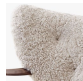
Sheepskin Moonlight 17mm