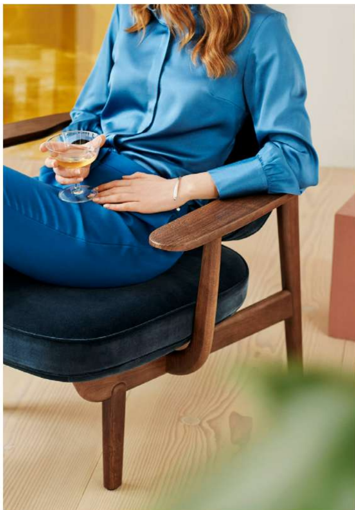
WALNUT STAINED OAK / HARALD 3 (VELVET) 182

Fred™ works in home, office and hospitality settings.