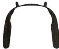
BLACK PAINTED ASH