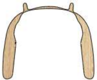
OAK (CLEAR LACQUERED)