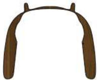
WALNUT STAINED OAK